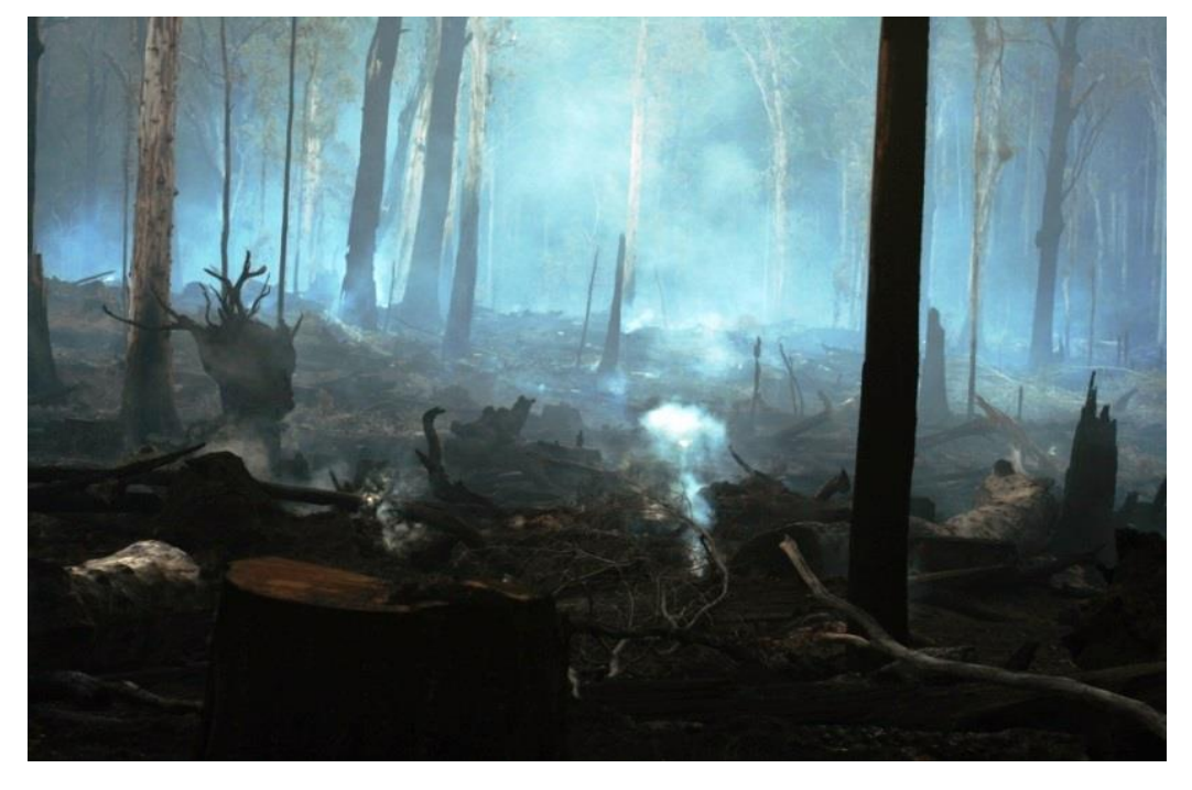
and across the state the machines move on