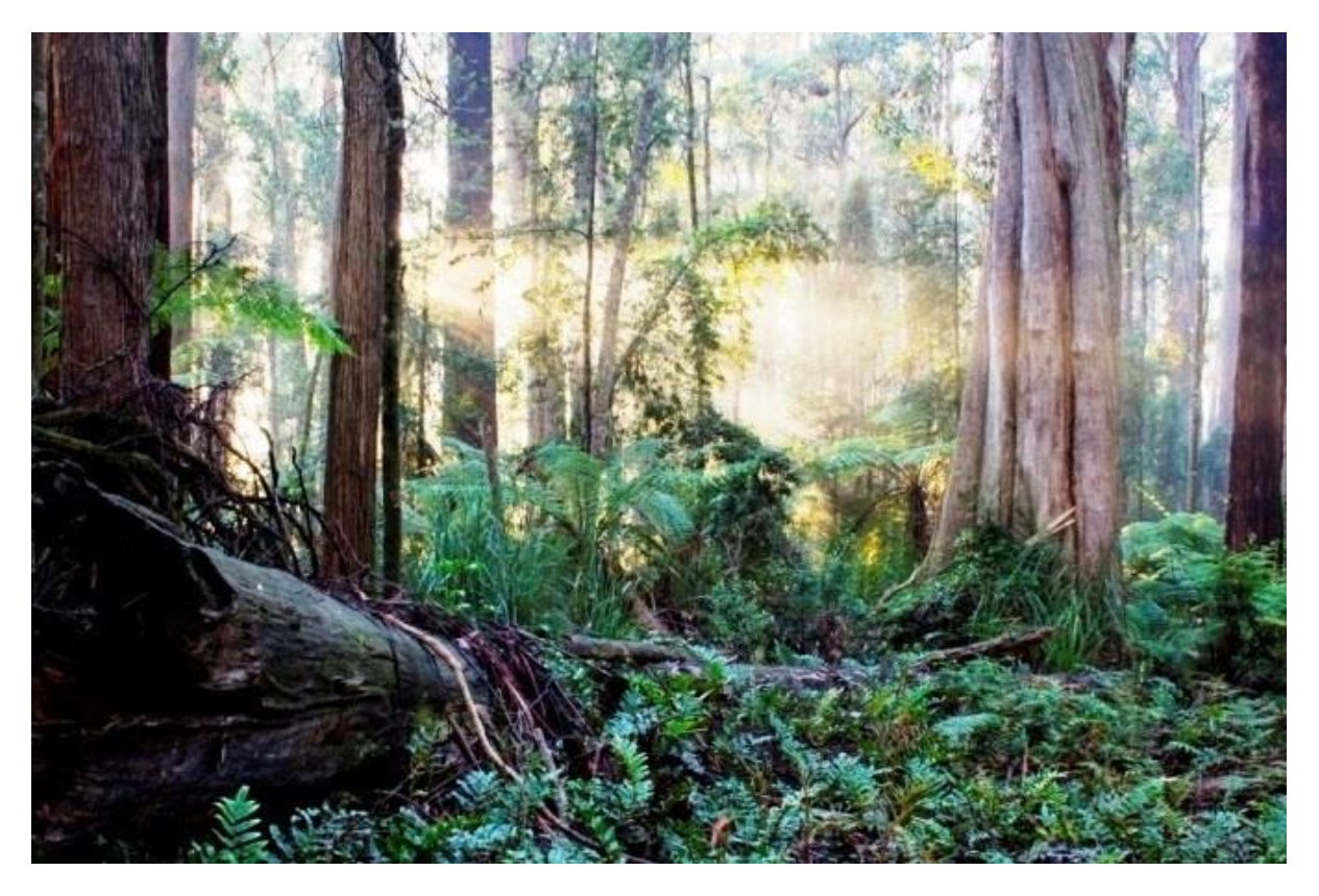
Brown Mountain Old Growth 2009 .... logged then burnt