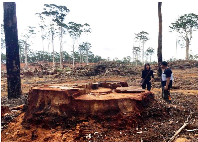
Trees carbon dated to 600 years old clear felled, for paper

Chuditch or Western Quoll are killed during logging or starve later or can't reproduce because they are left without dens, as hollow logs and stumps are removed or burnt. Jarrah forests are being stripped for low grade logs with pressure to increase the volume by up to three times the current amount.