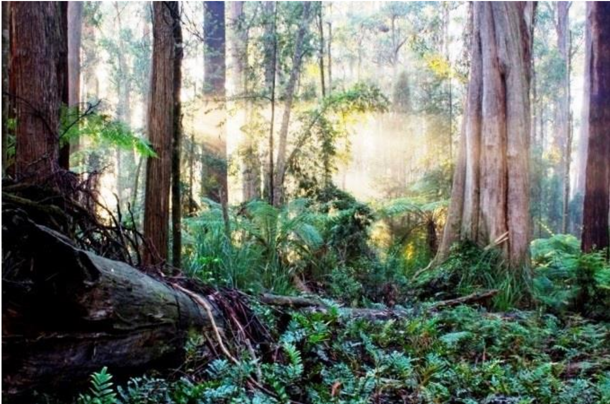
Brown Mountain Old Growth 2009 .... logged then burnt