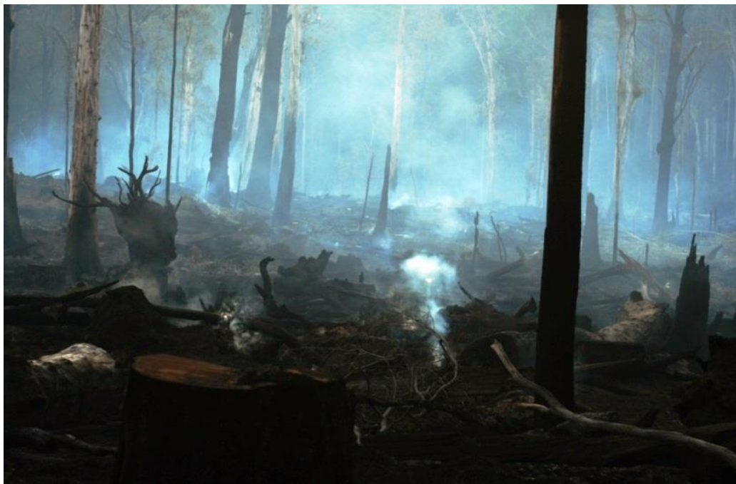
and across the state the machines move on