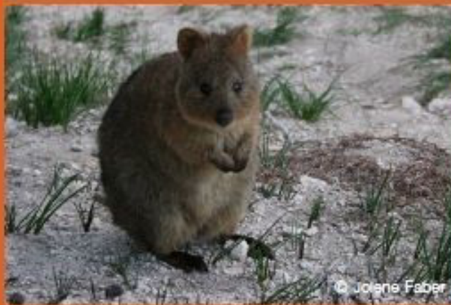
QUOKKA SETONIX BRACHYURUS

Western Australia: Endangered Commonwealth: Vulnerable