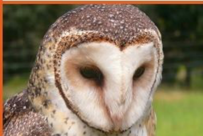
MASKED OWL TYTO NOVAEHOLLANDIAE

Victoria: Threatened Commonwealth: Vulnerable