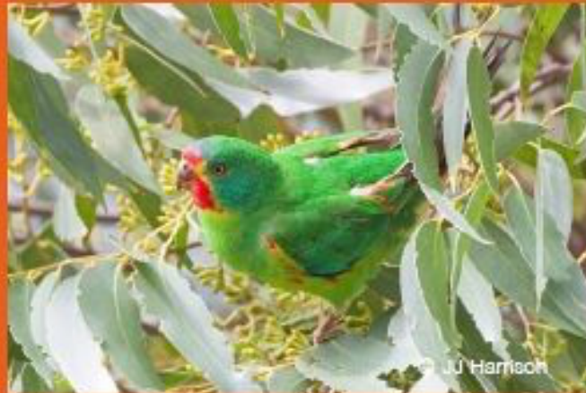
SWIFT PARROT LATHAMUS DISCOLOR PSITTACIDAE

Tasmania: Endangered Commonwealth: Vulnerable