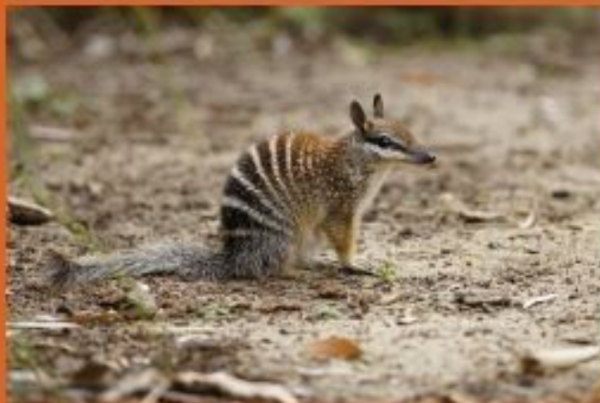
NUMBAT MYRMECOBIUS FASCIATUS

Western Australia: Endangered Commonwealth: Endangered