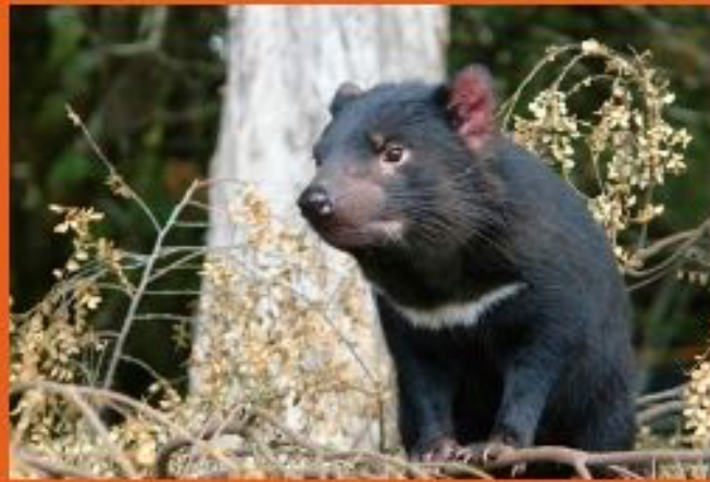
TASMANIAN DEVIL SARCOPHILUS HARRISII