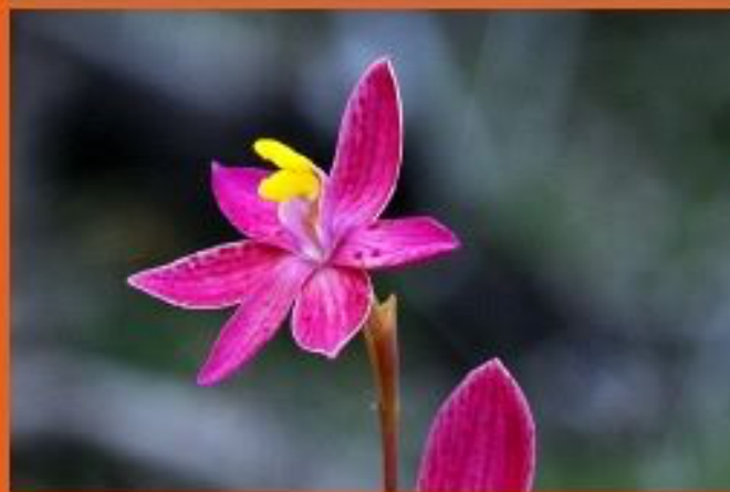
SPIRAL SUN- ORCHID THELYMITRA MATTHEWSII

Victoria: Threatened Commonwealth: Vulnerable