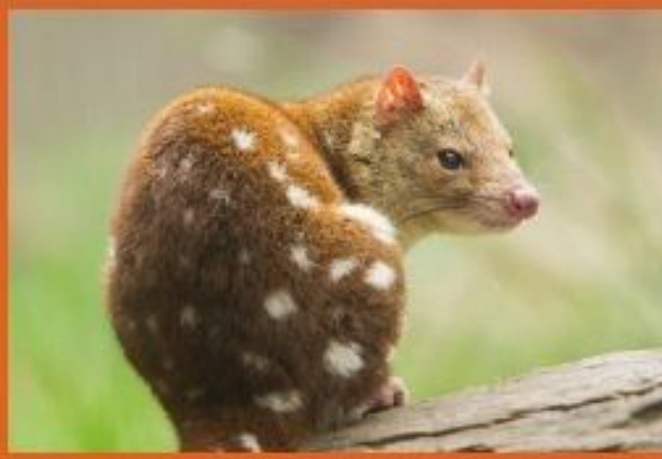
SPOTTED-TAILED QUOLL DASYURUS MACULATES

NATIONAL PARKS ASSOCIATION OF NSW protecting nature through community action