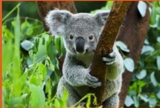
KOALA PHASCOLARCTOS CINEREUS

New South Wales: Vulnerable Commonwealth: Endangered