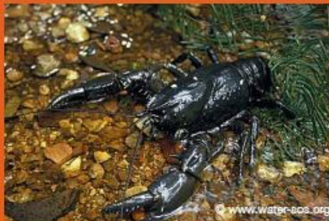
GIANT FRESHWATER CRAYFISH ASTACOPSIS GOULDI

Tasmania: Endangered Commonwealth: Endangered