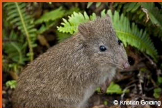
LONG-NOSED POTOROO POTOROUS TRIDACTYLUS

Victoria: Threatened Commonwealth: Critically Endangered