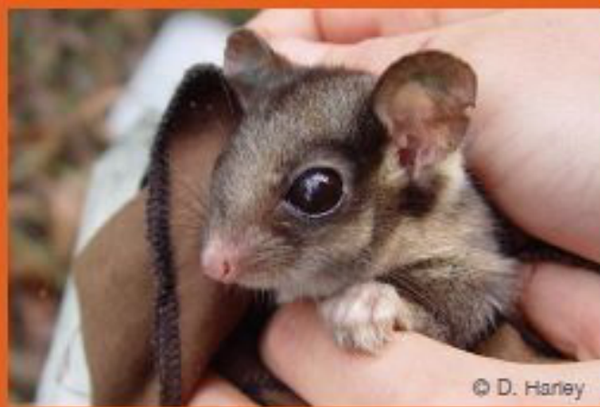
LEADBEATER'S POSSUM GYMNOBELIDEUS LEADBEATERI