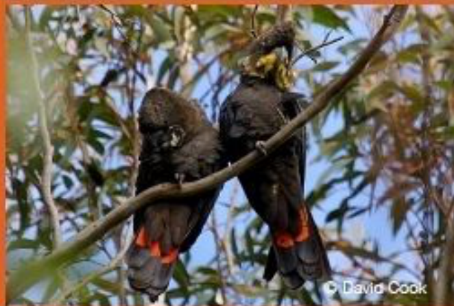
GLOSSY BLACK COCKATOO CALYPTORHYNCHUS LATHAMI

New South Wales: Vulnerable Commonwealth: Vulnerable