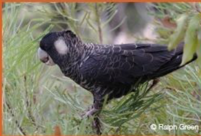
CARNABY'S BLACK-COCKATOO CALYPTORHYNCHUS LATIROSTRIS

Western Australia: Vulnerable Commonwealth: Vulnerable