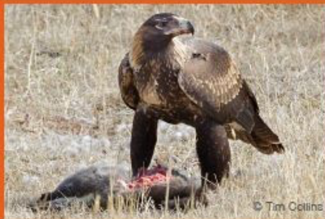
WEDGE-TAILED EAGLE AQUILA AUDAX FLEAYI

Tasmania: Endangered Commonwealth: Endangered