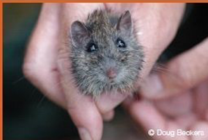
HASTINGS RIVER MOUSE PSEUDOMYS ORALIS

New South Wales: Endangered Commonwealth: Endangered