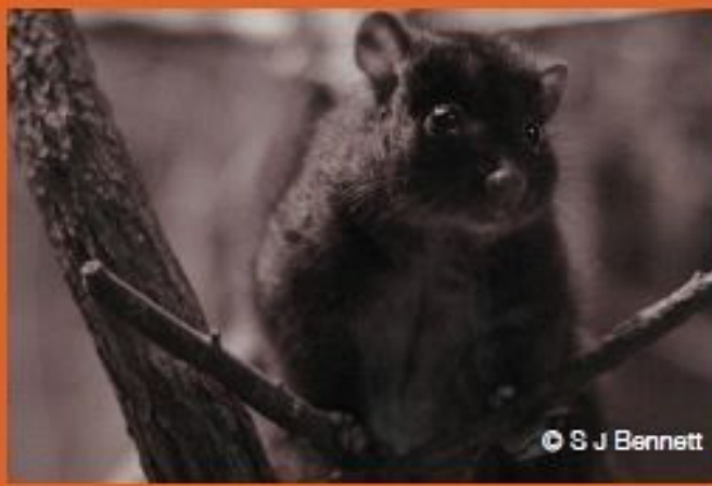
WESTERN RINGTAIL POSSUM PSEUDOCHEIRUS OCCIDENTALIS

NATIONAL PARKS ASSOCIATION OF NSW protecting nature through community action