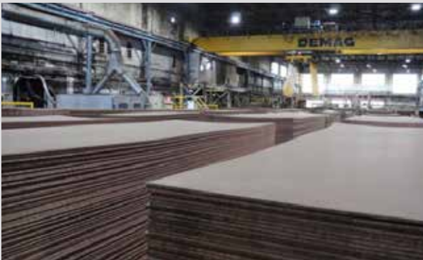
11. Wet processed fibreboard sheets