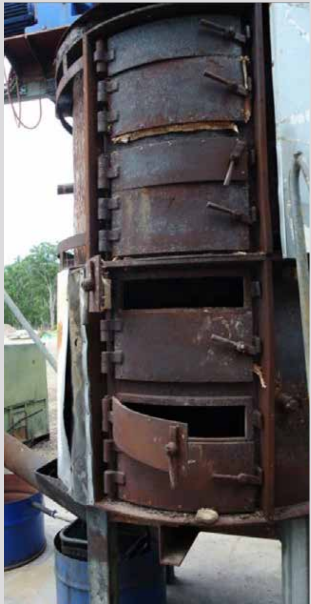
5. Biochar production in a wood fired retort with chambers (an initial pilot plant that is now not functional)