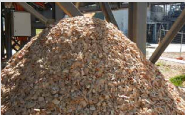
13. Oversize woodchips diverted from screens for boiler fuel