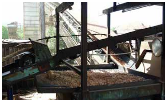
Woodchips for energy production