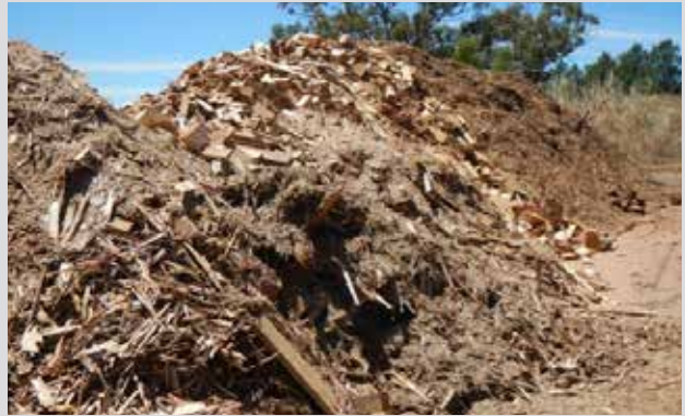
5. Residues for additional processing