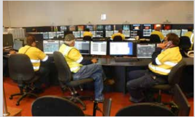
2. Control room for water treatment, energy island and pulp mill