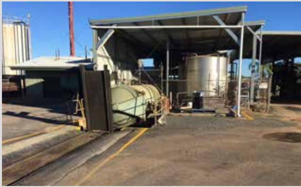
6. CCA treatment facility