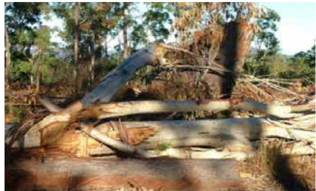
Low value by-products