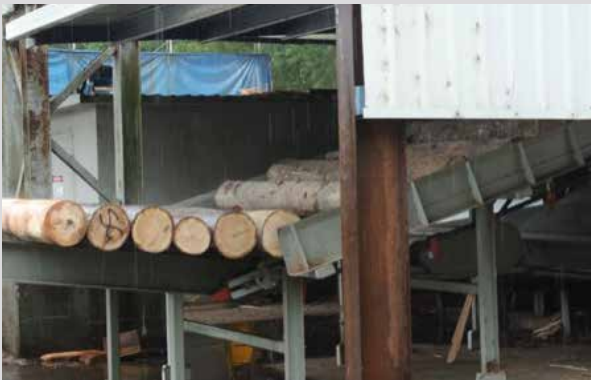
2. Spindleless lathe