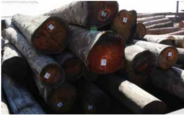
Tagged 'quota' logs at sawmill