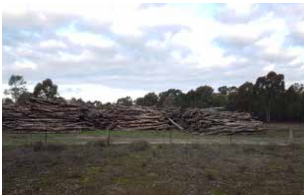
Thinnings left on-site

As such, thinning provides forest managers with a multi-purpose mechanism, one which promotes forest health and productivity while also providing valuable supplies to bioenergy markets.