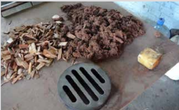
5. Timber feedstocks and paraffin wax