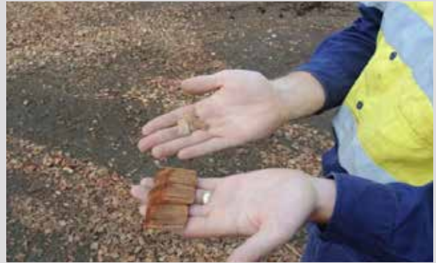
2. Woodchip feedstock