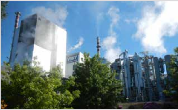
17. Recovery boilers (left), evaporation plant (right)