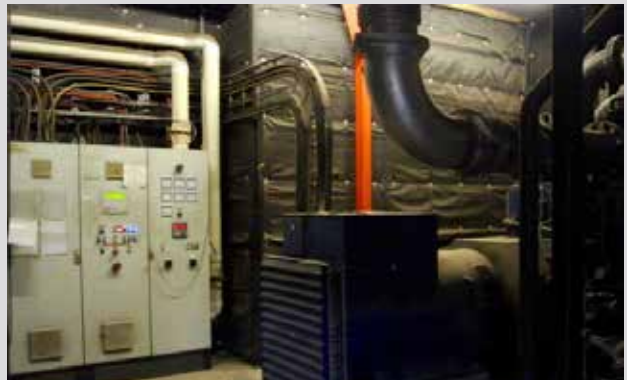
3. Cogeneration unit