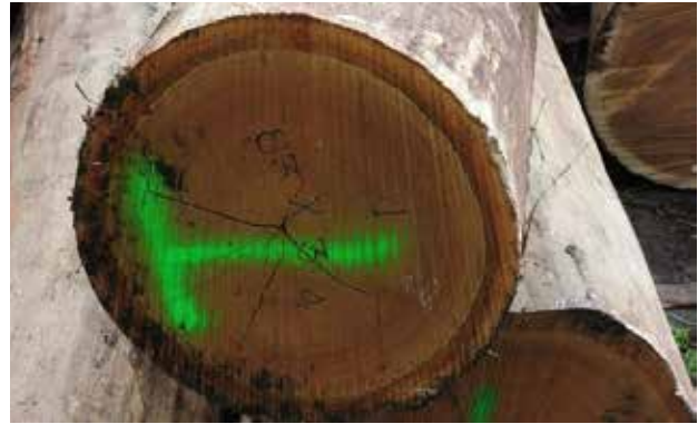
On-site measuring, grading and marking

In-truck weighing systems are frequently used, including for the lower grade products such as firewood.