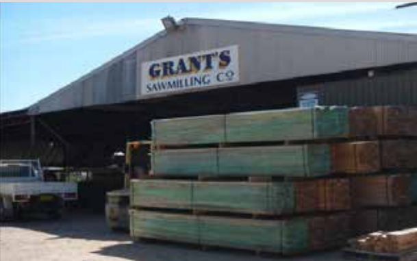
2. Grants Sawmilling Co Narrandera site