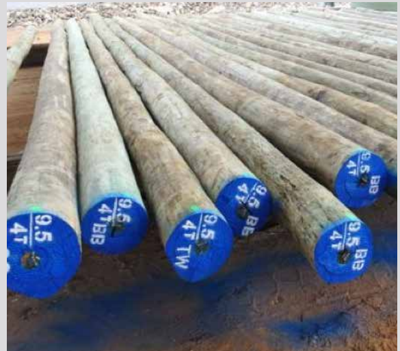
9. Final product labeling to customer