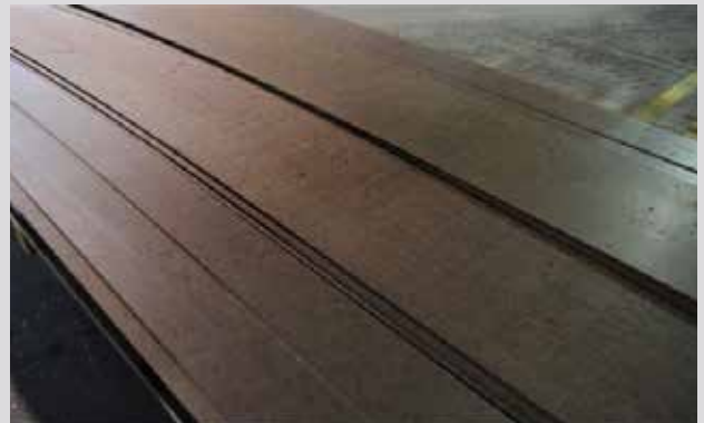
12. Wet processed fibreboard sheets