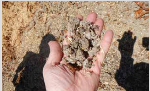
10. Reject woodpulp from recycled fibre plant for boiler fuel