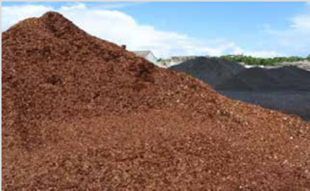
3. Woodchip feedstock (left) and coal (right)