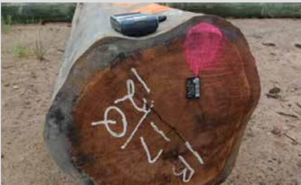
2. Handheld device, unique log identification tag and other markings