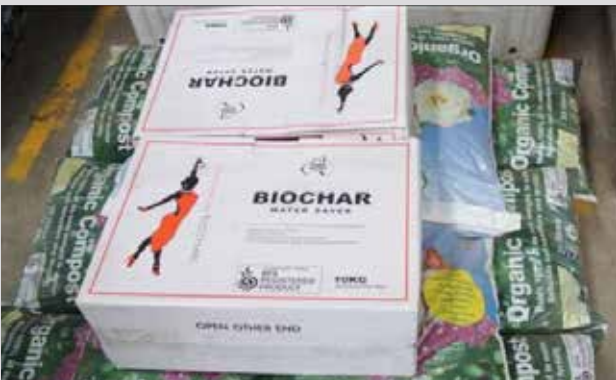
3. Packaged organic compost and biochar