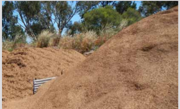
6. Graded finished products