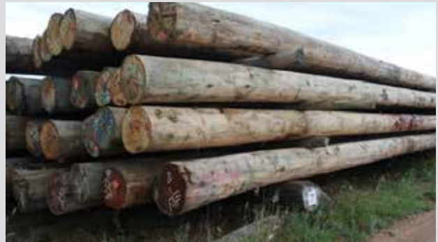
3. Pretreatment seasoning of logs in racks