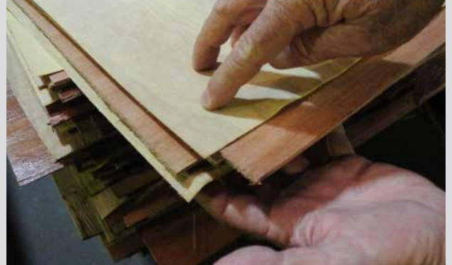
5. Veneer sheets assembled into plywood