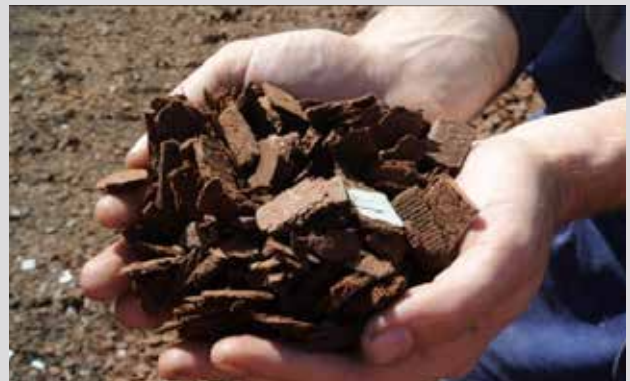
4. Chipped reject hardboard and acrylic primer