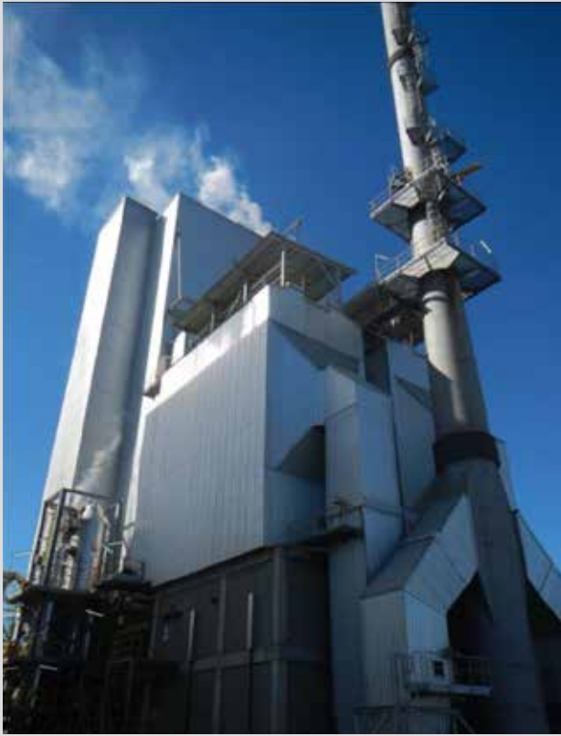
18. Recovery Boiler B, electrostatic precipitator and stack