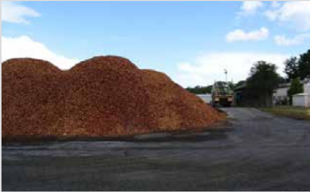
1. Woodchip feedstock (left) and weighbridge (right)