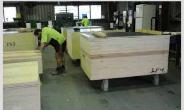
7. Trimmed plywood packs