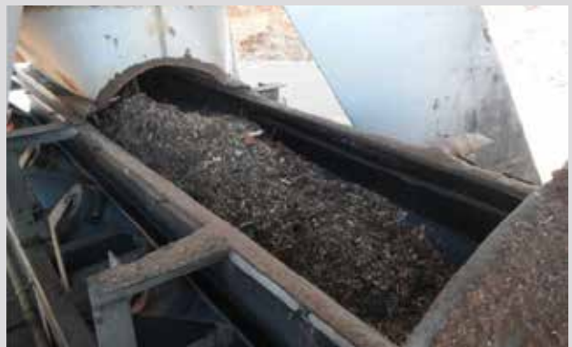
14. Boiler fuel feedstock to Power Boiler