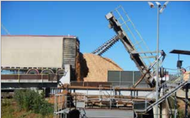
7. Boiler fuel receiver