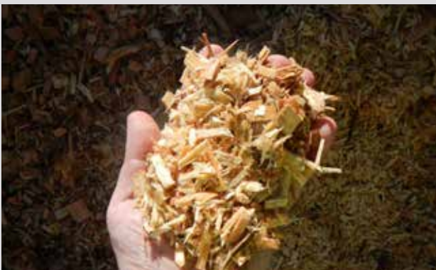
11. Woodchip screen fines for boiler fuel