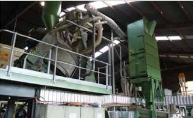
1. Eirich high speed coating granulation and mixing plant for biochar applications