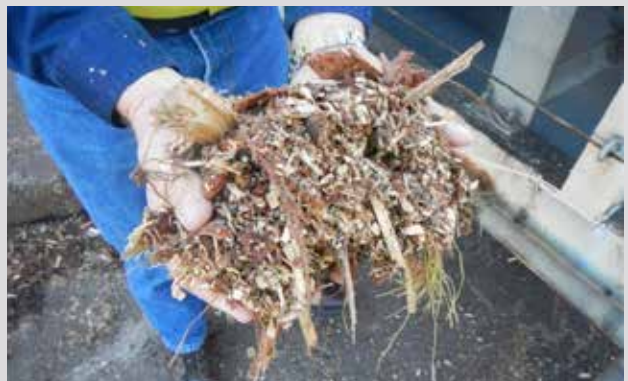
12. Boiler fuel feedstock to Power Boiler