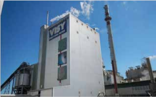
15. Power Boiler (left) and Recovery Boiler A