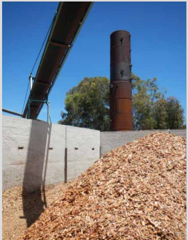
7. Wood chips for market and obsolete (and unused) smokestack