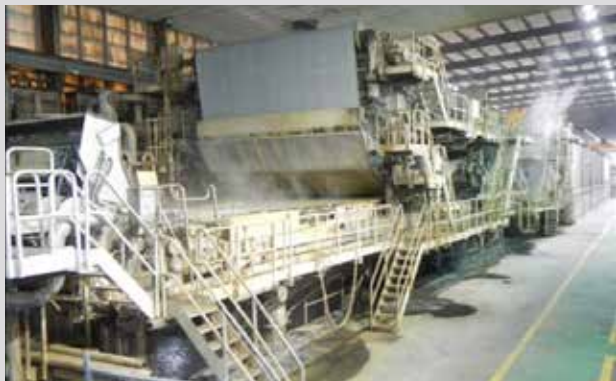
5. VP9 wet end