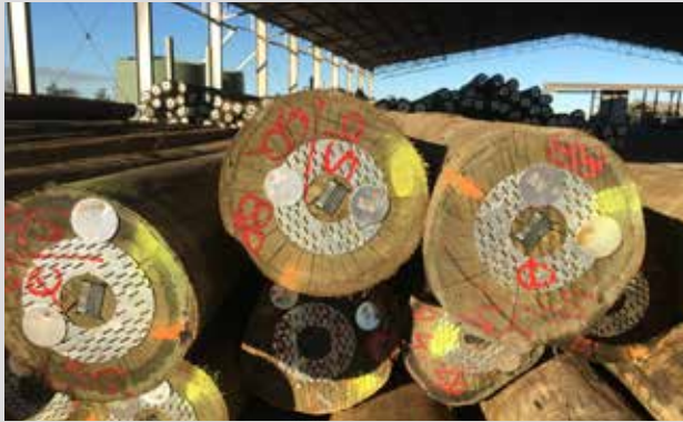
7. Post treatment drying