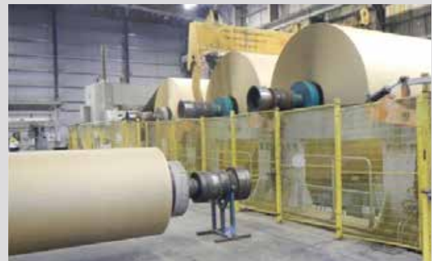
6. Jumbo reels at VP10 winder