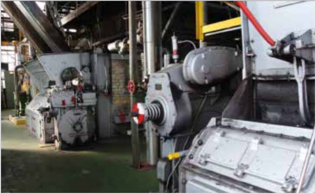
7. Weathertex boilers