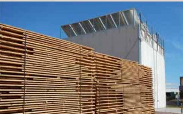
3. Solar photovoltaic cells on kiln hot water heating