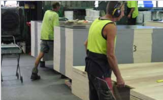
6. (Background) Packs of Formply ready for strapping and (Foreground) raw anti-slip plywood being puttied