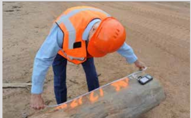
4. Verification of grading