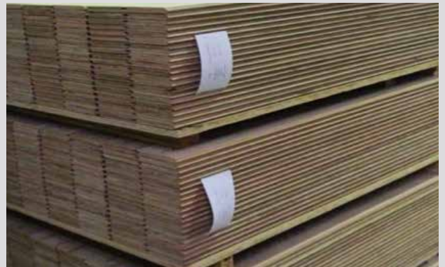
9. Finished flooring boards