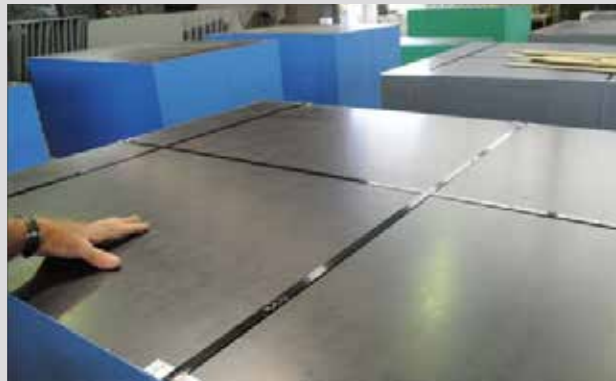
8. Painted plywood packs ready for branding