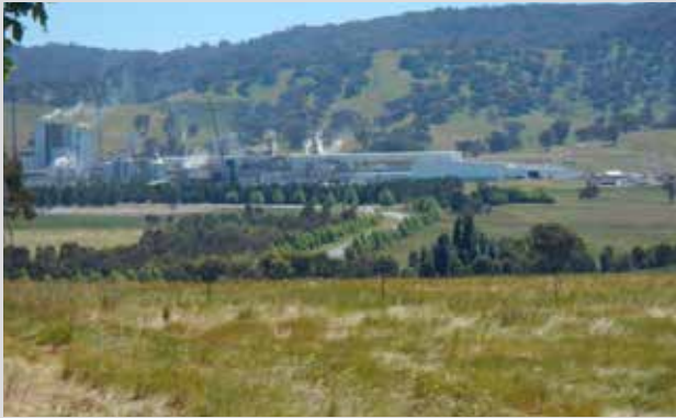
1. Visy Pulp and Paper – Tumut Mill