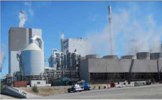
16. Recovery boilers (rear), evaporation and cooling plant