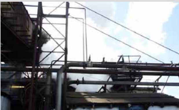
9. Steam exhaust from Masonite gun