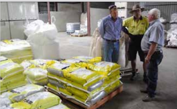
4. Inspecting stockfeed end products with biochar added