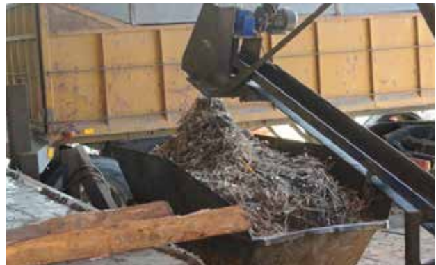
Shavings and offcuts