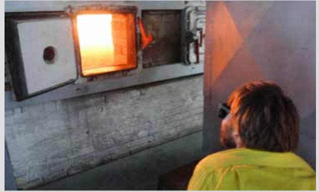
8. Conal O'Neill (Process Engineer) inspecting Weathertex boiler