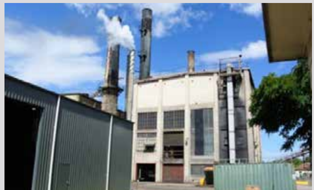
6. Weathertex boilerhouse and initial production