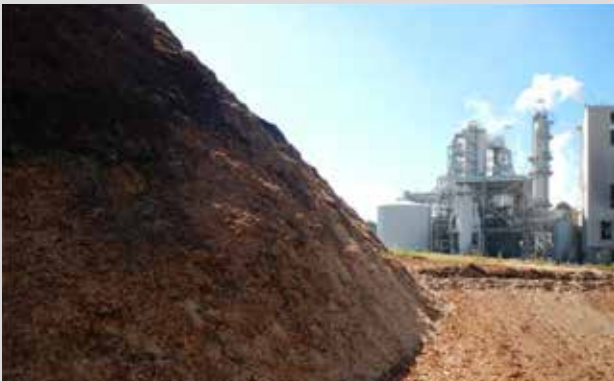
9. Boiler fuel stockpile, lime kilns and recaustising plant (rear)