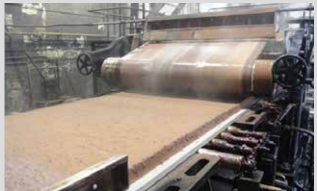
10. Initial pressing of wet processed fibreboard