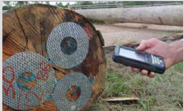
5. Handheld verification of log history