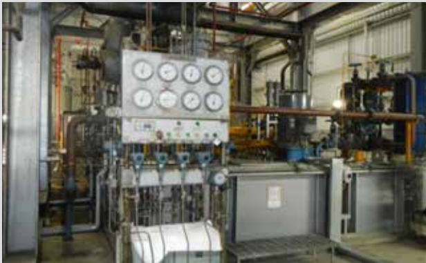
3. 8MW turbine hall