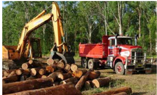
In-truck weighing systems allow sale by weight