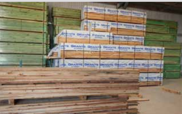
4. Warehousing of Grants' finished products