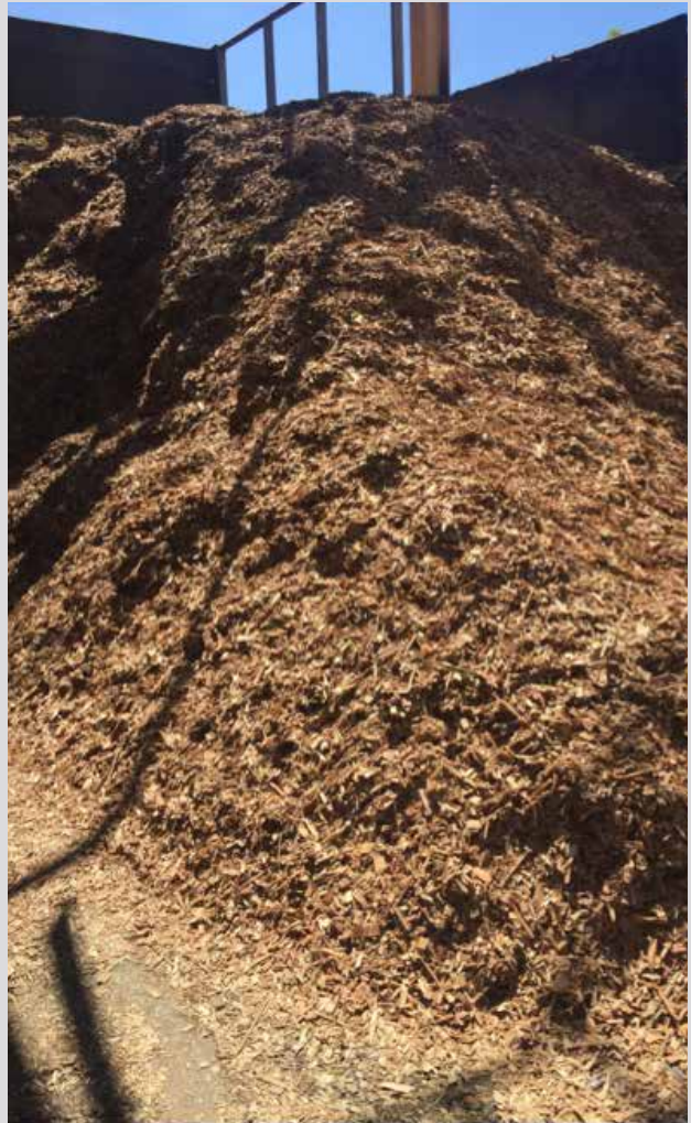
1. Residues for use in cogeneration