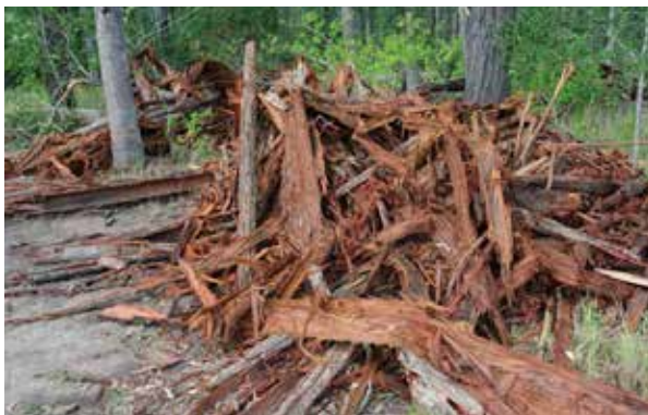
Bark left on-site