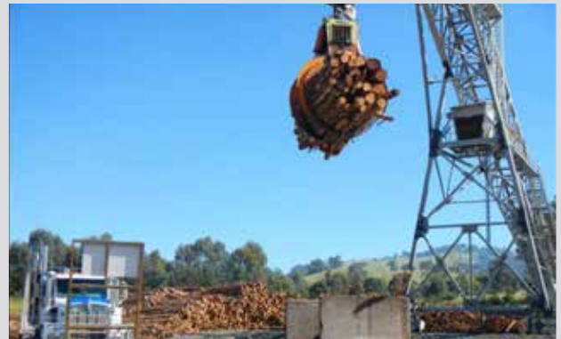
4. Mill woodyard log crane